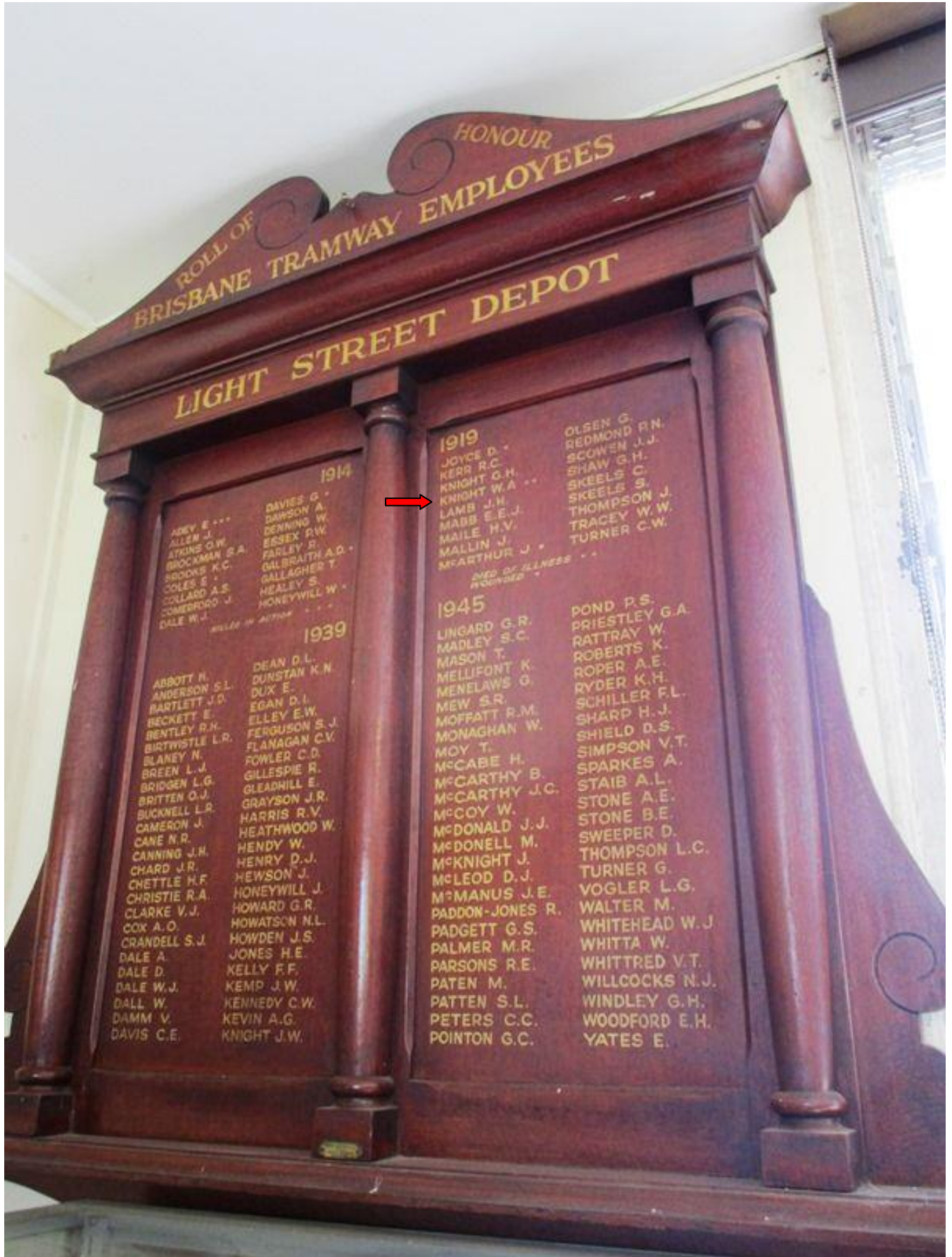
Light Street Depot Roll of Honour