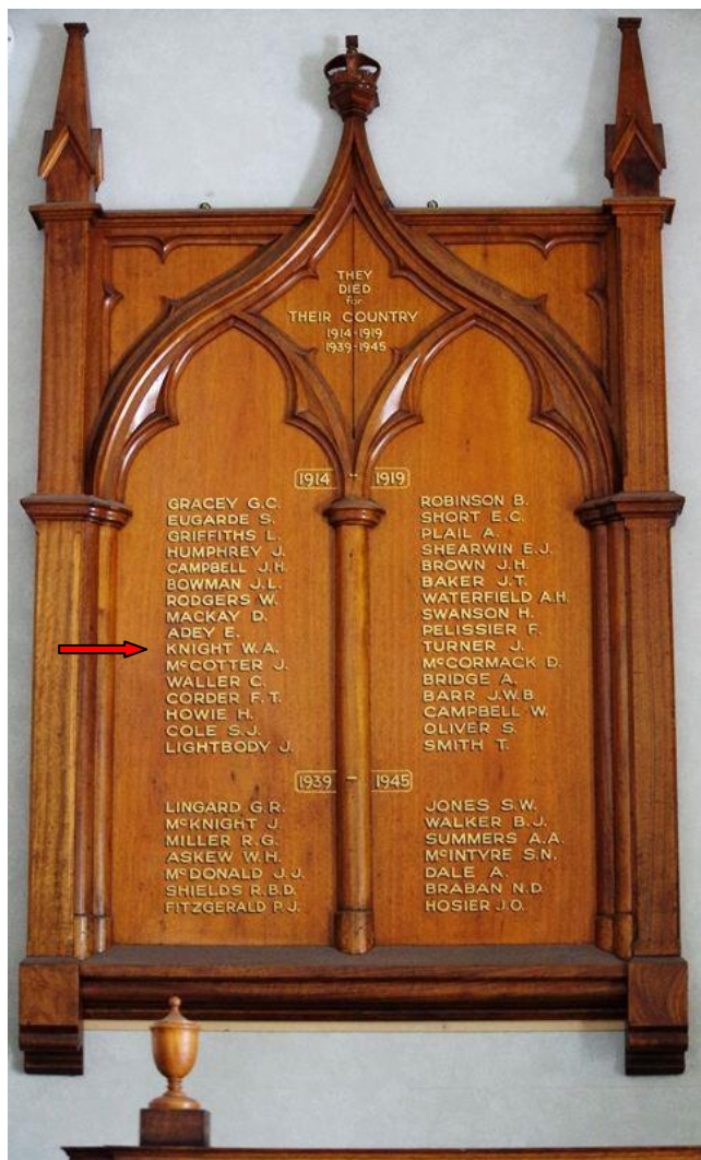
Brisbane City Hall Honour Roll